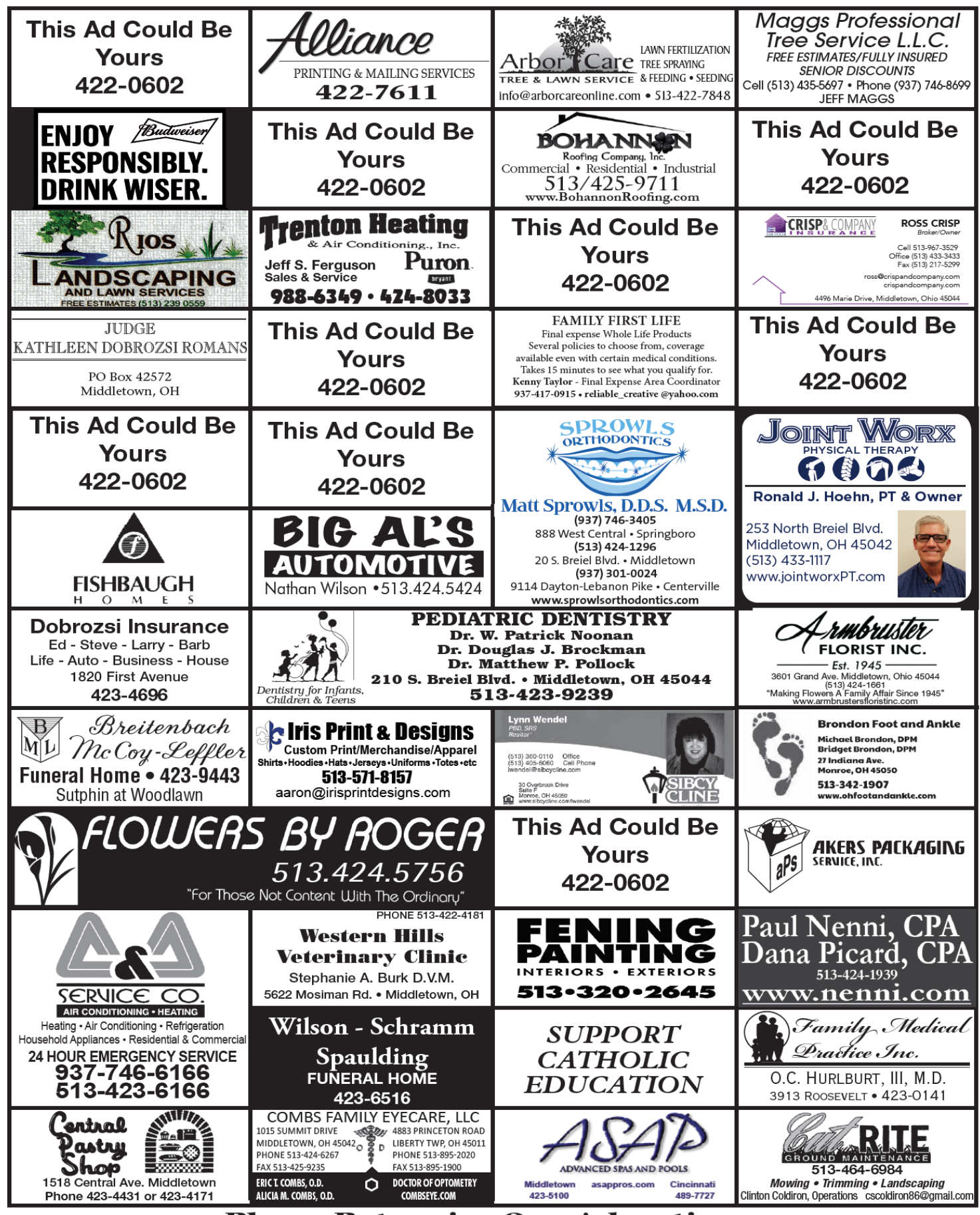
Please Patronize Our Advertisers